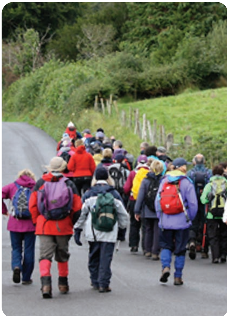
Photo: Holey Soles walking club

Finally, two public consultation meetings were held at Draft Recreation Strategy stage in October 2022 to garner final feedback from communities across the county on key proposals.