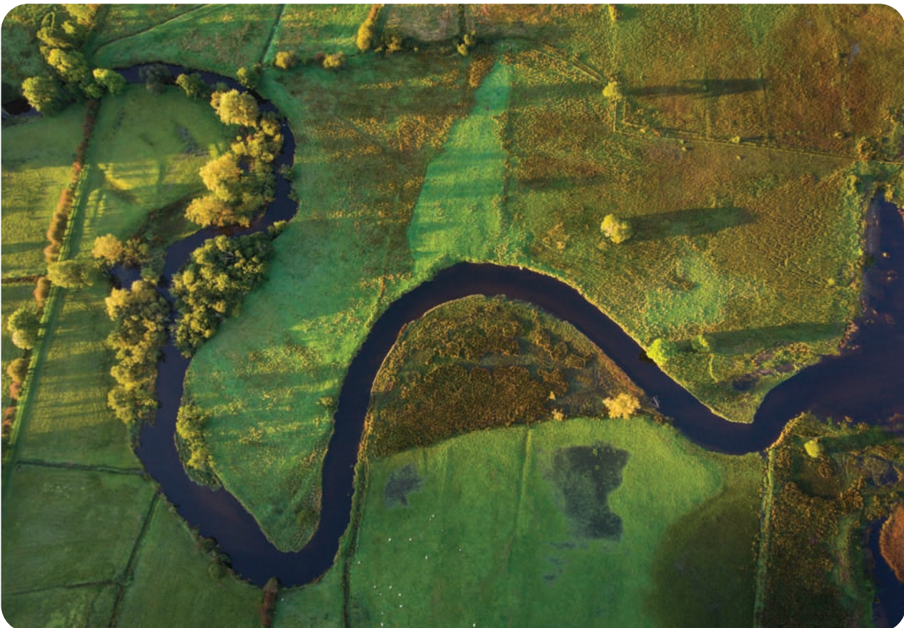
Leitrim- a paradise of land and of water

A more detailed Strategic Action Plan is presented in the Recreation Strategy (Volume 2) to provide a ‘road map’ for development of these various land and water-based signature and local initiatives that will position County Leitrim firmly as a ‘must see, must do’ recreational destination on the national outdoor recreation map.