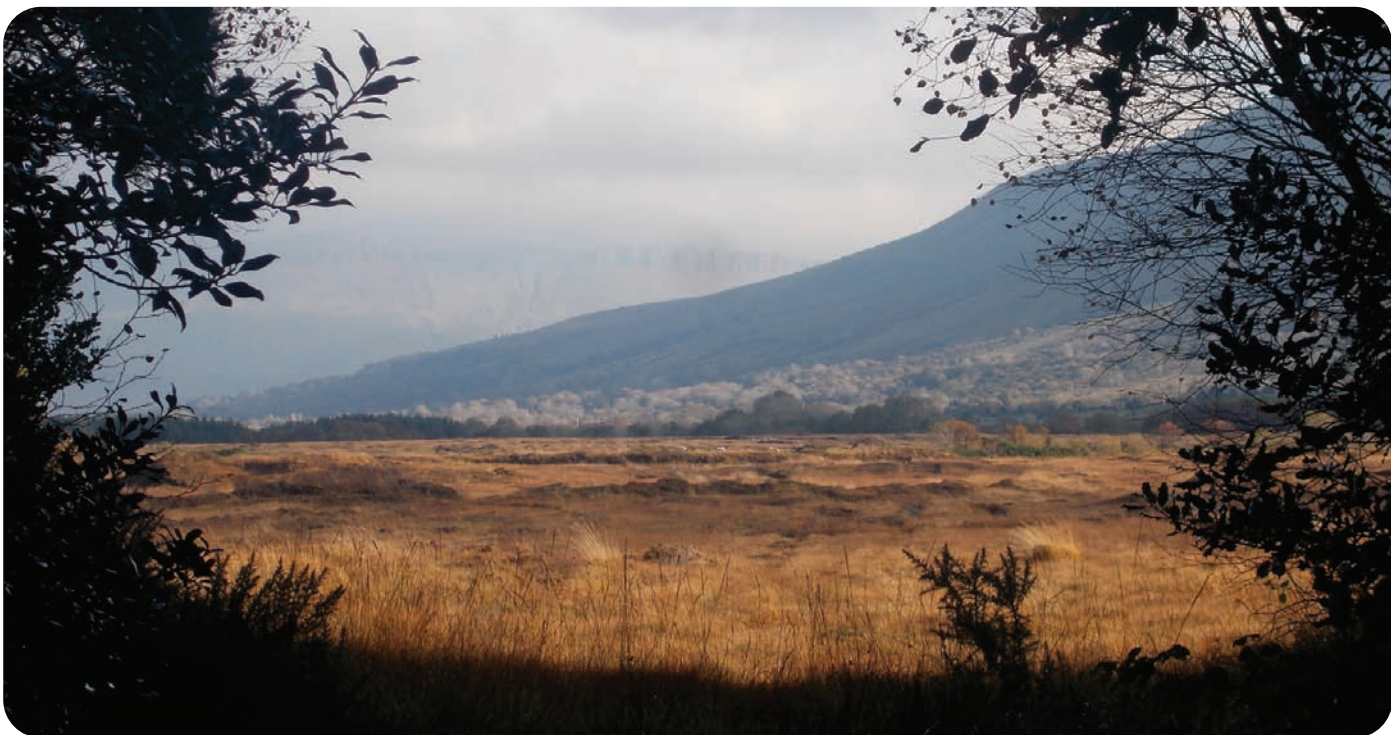
Potential bog trail at Tawley, North Co. Leitrim

There is scope to expand the lakeshore walking network, alongside Lough Melvin, Garadice, Gulladoo and Lough Boderg, all of which would require integrated services such as parking, picnic spots, viewing points, as well as standard services such as WC and waste management. It is notable that the development of walking trails is increasingly challenging for many community-based trail planners and managers, with particular reference to permissive access,